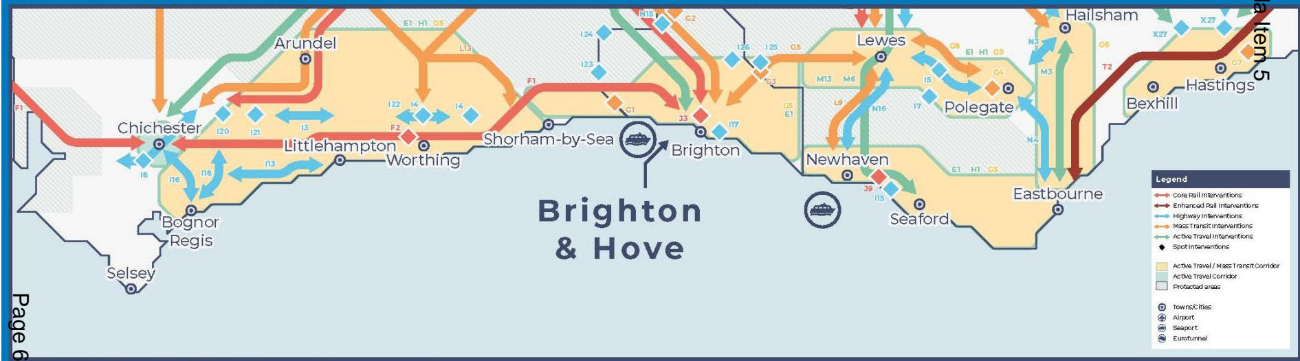
Figure 5: Sussex Coast packages of interventions